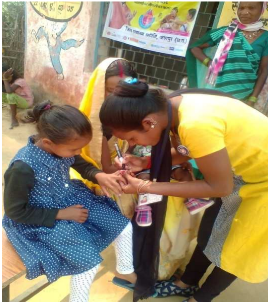
Pulse Polio Abhiyan