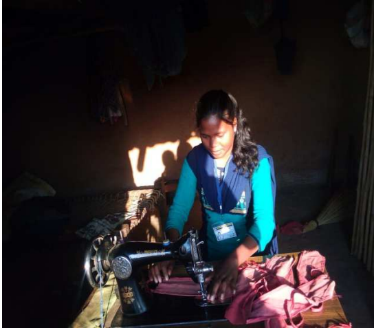
Mask Making by NSS Volunteers